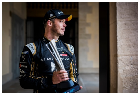
Monroe® Safety Ambassador Andre Lotterer took second place in Paris at the ABB FIA Formula E Championship!